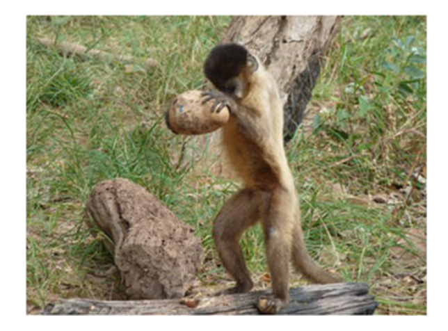
FIGURE 1 Female bearded capuchin monkey (Piaçava) using a 1,042 g quartzite stone to crack a palm nut. The monkey is in the process of lowering the stone. The nut on the anvil is a fragment of a whole nut. The monkey is holding a whole nut in her left foot. Notice the monkey has her left hand on the top of the stone and grips the edge of the stone with her right hand. Capuchin monkeys commonly lift the stone with both hands gripping the edges, then shift one or both hands from the edge to the top of the stone at the zenith of the lift. The faces of the stone in this photo were marked with numbers to aid in coding the position of the stone (the number 2 shows in the photo).

The study was conducted in the outdoor laboratory, a flat area with a relatively closed, high canopy, and thin undergrowth affording